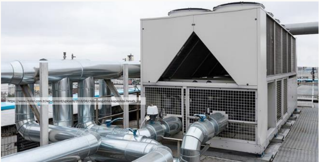
Cooling Systems (Chiller)

Closed loop cooling systems significantly reduce water consumption compared to open loop systems with more intensive water use. In closed loop systems, while the same water is recirculated within the system, it is usually necessary to add cooling water equal to the amount of water evaporated. By optimising cooling systems, evaporation losses can also be reduced.