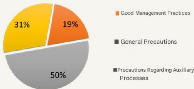
Percentage Distribution of Water Efficiency Practices