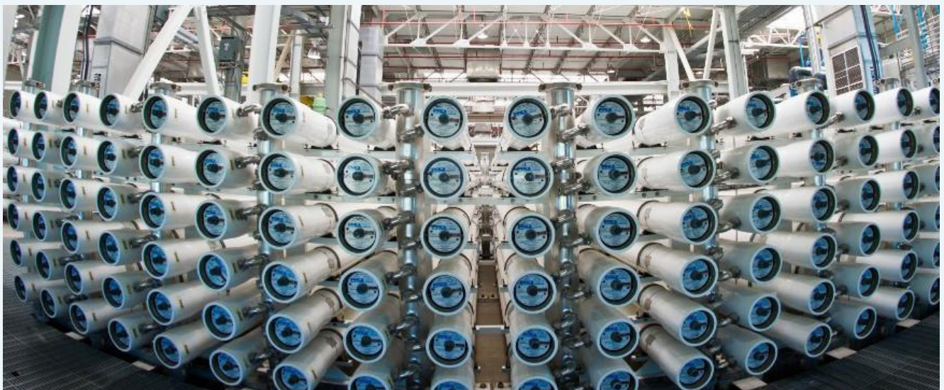
Reverse Osmosis System

Savings are achieved by reusing nanofiltration or reverse osmosis concentrates with or without treatment depending on their characterisation. Measures should be taken to reduce water consumption by reusing clean water in the production processes of filter backwash water in filtration processes and using cleaning systems (TOB, 2021).