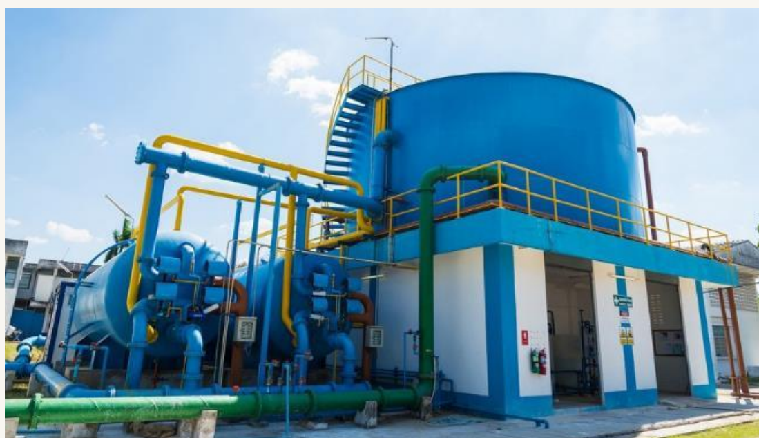
Industrial Wastewater Treatment Plant

The implementation of integrated wastewater management strategies can lead to an average reduction of up to 25% in water consumption, wastewater quantity and pollution loads of wastewater. The potential payback period of the implementation varies between 1-10 years (MoAF, 2021).