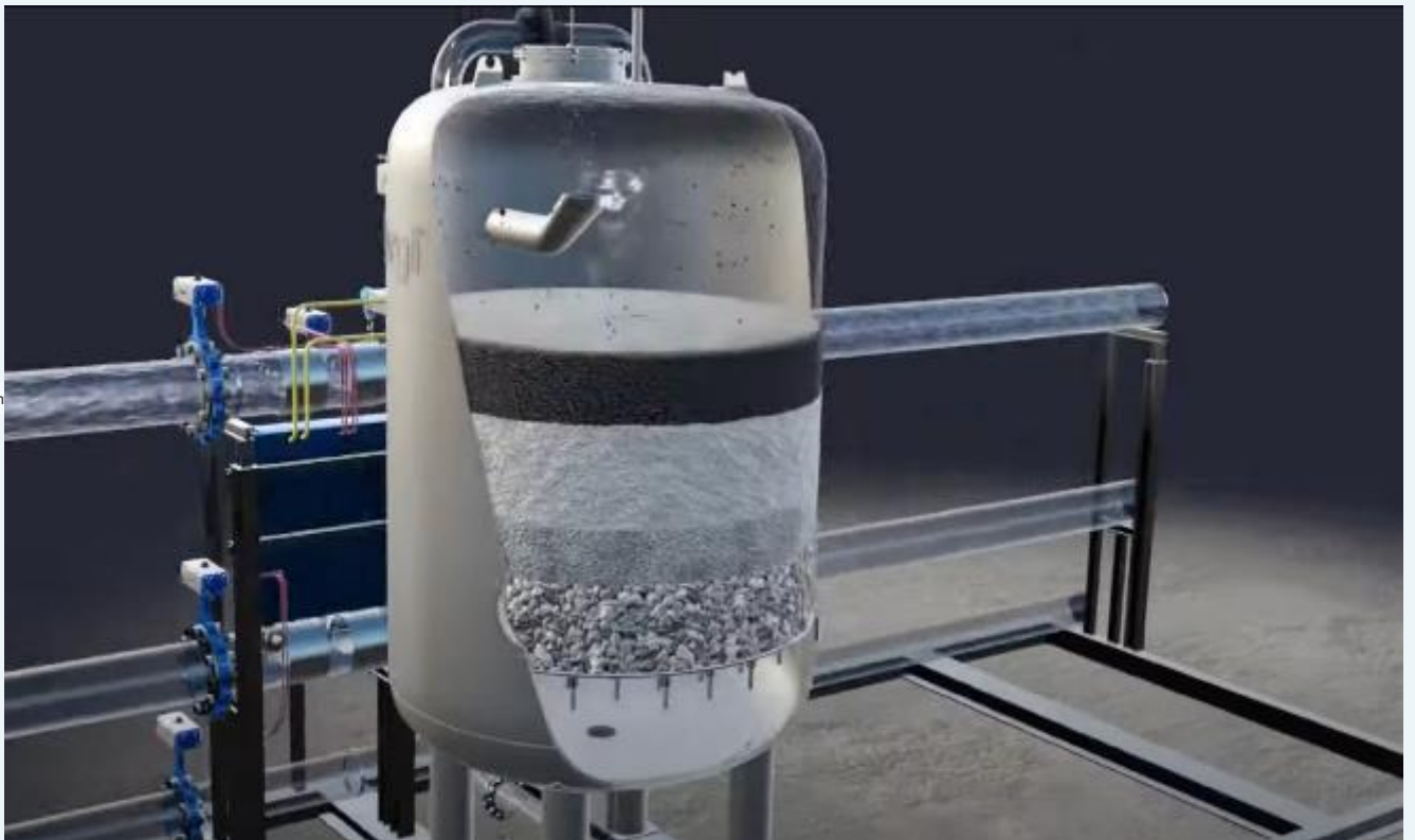
Water Softening Systems 24 Water Efficiency Guidance

Wastewater generated in industrial facilities is not only industrial wastewater from production processes, but also includes wastewater from showers, sinks, kitchens, etc. Wastewater from shower, sink, kitchen etc. areas is called grey water. Water savings can be achieved by treating these grey waters with various treatment processes and using them in areas that do not require high water quality.