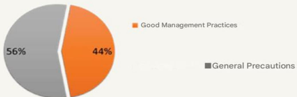
Percentage Distribution of Water Efficiency Practices