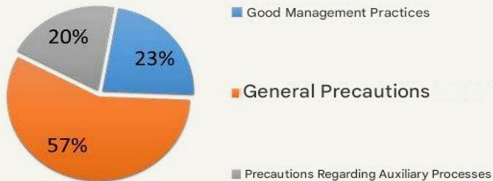
Percentage Distribution of Water Efficiency Practices