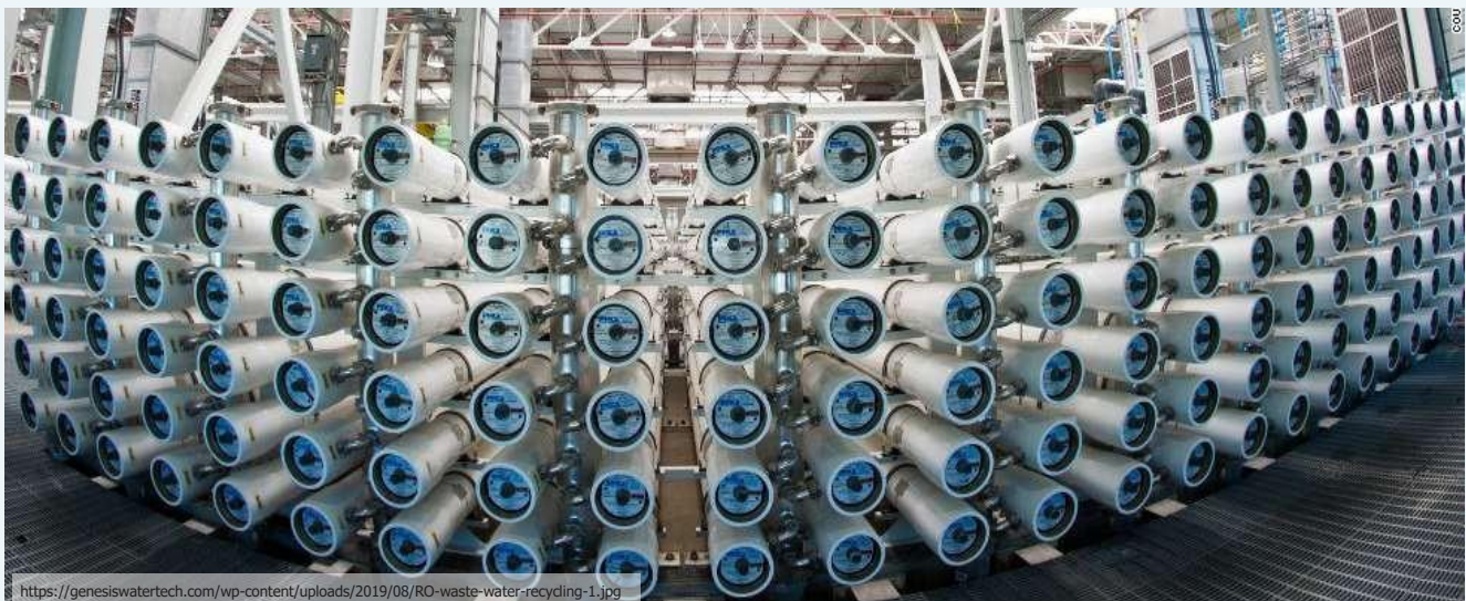
Reverse Osmosis System

Wastewater generated in industrial facilities is not only industrial wastewater originating from production processes, but also includes wastewater originating from showers, sinks, kitchens, etc. Wastewater consisting of showers, sinks, kitchens, etc. is called gray water. Water savings can be achieved by treating these gray waters with various treatment processes and using them in areas that do not require high water quality.