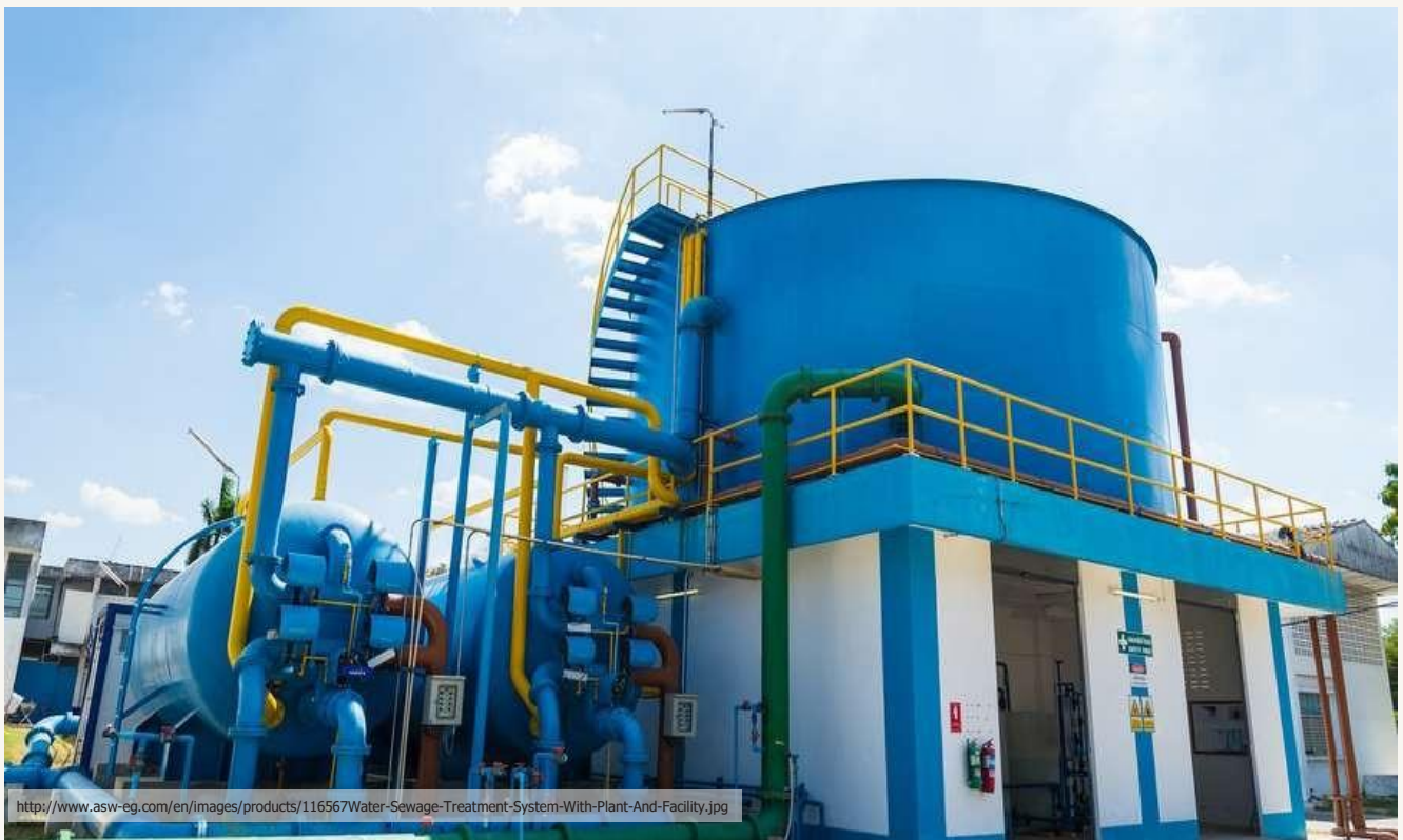
Industrial Wastewater Treatment Plan

With the implementation of integrated wastewater management strategies, an average reduction of up to 25% in water consumption, wastewater quantity and pollution loads of wastewater can be achieved. The potential payback period of the application ranges from 1-10 years (MoAF, 2021).