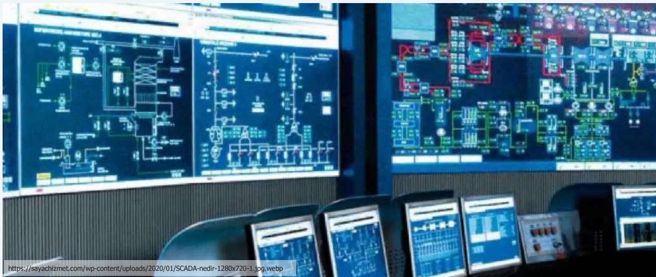
Computer Aided Control System

In our country, reverse osmosis (RO) concentrates are combined with other wastewater streams and given to the wastewater treatment plant channel. The concentrates formed in the RO systems used for additional hardness removal can be used in garden irrigation, in-plant and tank-equipment cleaning (TUBITAK MAM, 2016; MoAF, 2021). In addition, with the structuring of raw water quality monitoring, it is possible to re-evaluate RO concentrates by feeding them back into raw water reservoirs and mixing them (MoAF, 2021).