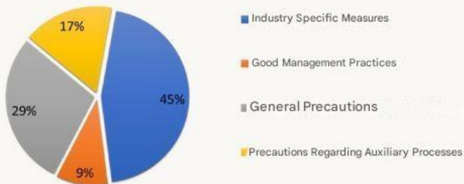
Percentage Distribution of Water Efficiency Practices