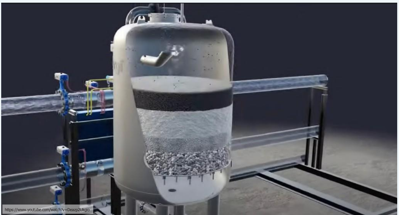
https://www.youtube.com/watch?v=Deazp2Ukgio Water Softening Systems

It is very important to determine the optimum regeneration frequency in regeneration systems. Although regeneration in water softening systems is adjusted according to the frequency recommended by the supplier or depending on the flow rate and time entering the softening system, this frequency also varies depending on the calcium concentration in the raw water. For this reason, online hardness measurement is applied when determining the frequency of regeneration. Thus, regeneration frequencies can be optimized, as well as excessive washing, rinsing or backwashing with salt water can be prevented by using online hardness sensors.