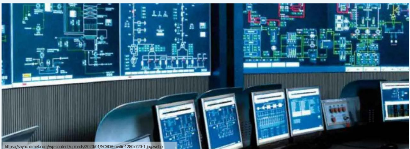
Computer Aided Control System

Since inefficient resource use and environmental problems in industrial facilities are directly related to input-output flows, process inputs-outputs should be defined in the best way specific to production processes (TUBITAK MAM, 2016). Thus, it becomes possible to develop measures to increase resource efficiency, economic and environmental performance. Organizing input-output inventories is considered a prerequisite for continuous improvement. While such management practices require the participation of technical staff and senior management, they pay for themselves in a short time with the work of various experts (IPPC BREF, 2003). It is necessary to use measurement equipment on the basis of application processes and to perform some routine analyzes/measurements specific to the processes. In order to obtain the highest level of efficiency from the application, using computerized monitoring systems as much as possible ensures that the technical, economic and environmental benefits to be obtained are increased (TUBITAK MAM, 2016).