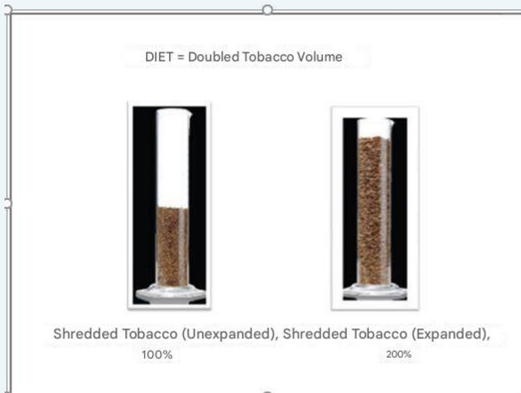
Extended Tobacco with Dry Ice (DIET) Method

In the Dry Ice Expanded Tobacco (DIET) method, the tobacco volume is increased by using the thermal-physical properties of carbon dioxide. With the DIET method, filling costs are reduced with economical, high-quality and high-performance production by providing extra filling power in cigarette paper of tobacco. Tobacco is impregnated with liquid carbon dioxide under pressure. Excess carbon dioxide in liquid and gaseous form is recovered for reuse by gradual press discharge. The carbon dioxide in tobacco turns into dry ice. The impregnated tobacco is rapidly expanded and cooled in the hot gas stream. With this method, since the unit volume per weight of tobacco increases, twice the volume of the same amount of tobacco is obtained.