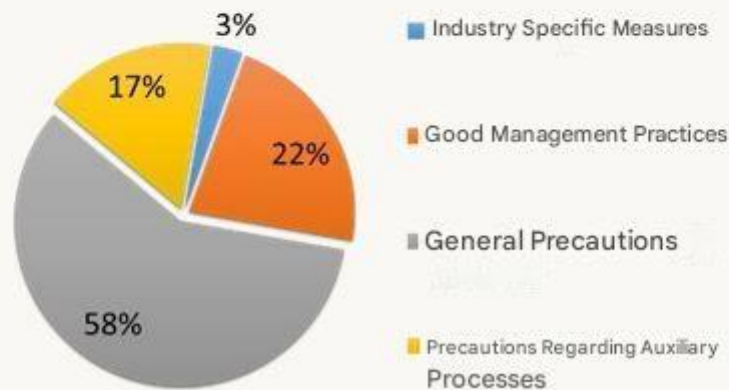
Percentage Distribution of Water Efficiency Practices