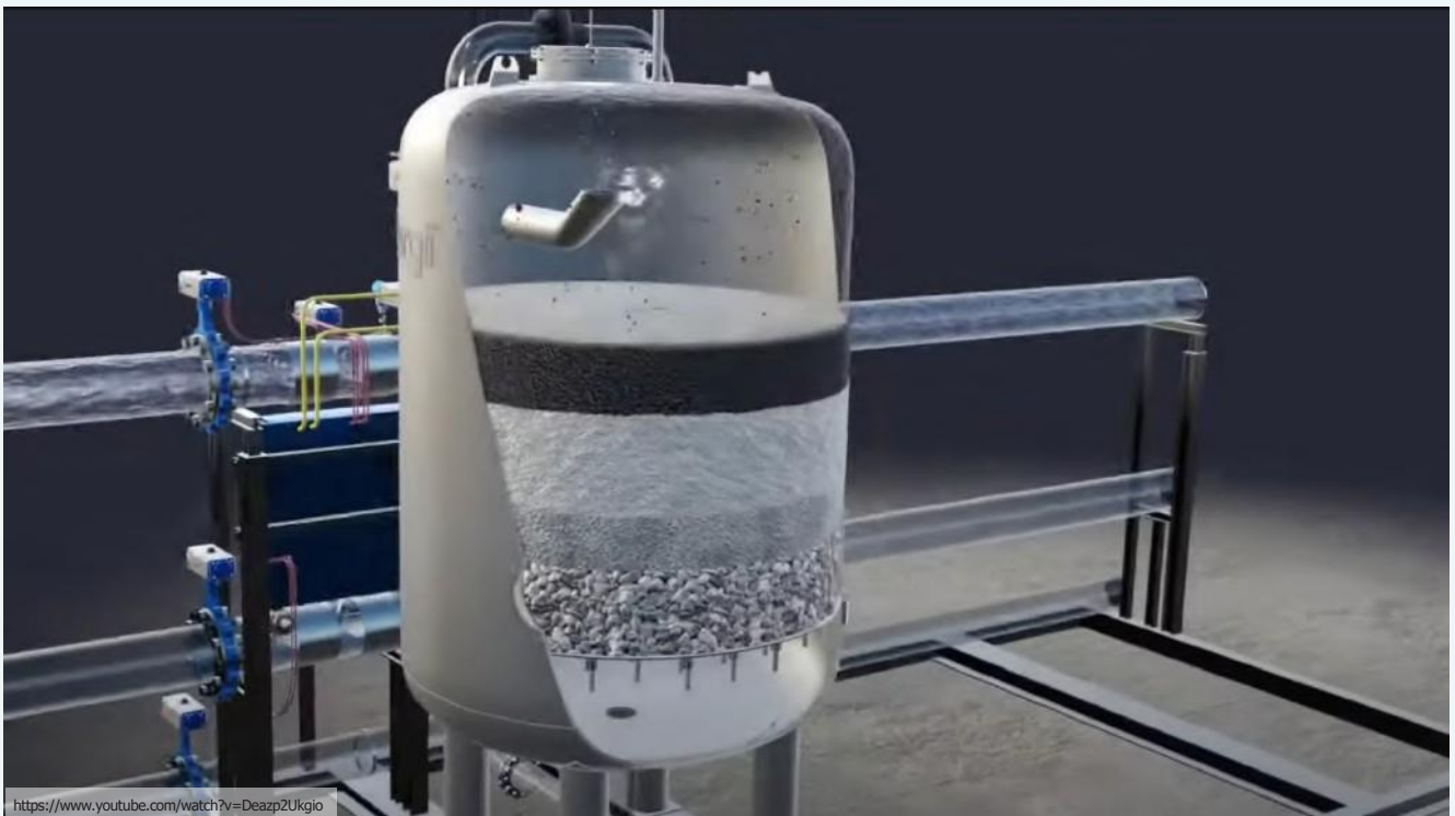
Water Softening Systems

It is very important to determine the optimum regeneration frequency in regeneration systems. Although regeneration in water softening systems is adjusted according to the frequency recommended by the supplier or depending on the flow rate and time entering the softening system, this frequency also varies depending on the calcium concentration in the raw water. For this reason, online hardness measurement is applied when determining the frequency of regeneration. Thus, regeneration frequencies can be optimized, as well as excessive washing, rinsing or backwashing with salt water can be prevented by using online hardness sensors.