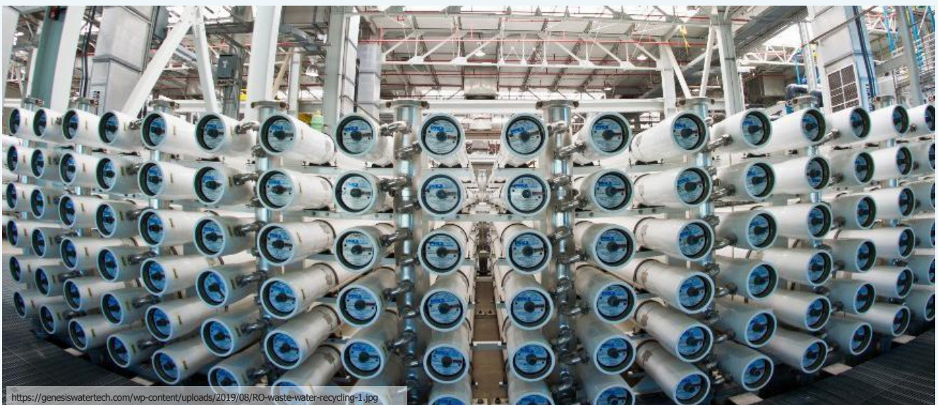
Reverse Osmosis System

Depending on the characterization of nanofiltration or reverse osmosis concentrates, savings are achieved by reusing them with or without treatment. Measures should be taken to reuse clean water in the production processes of filter backwash water in filtration processes and to reduce water consumption by using cleaning systems (MoAF, 2021).