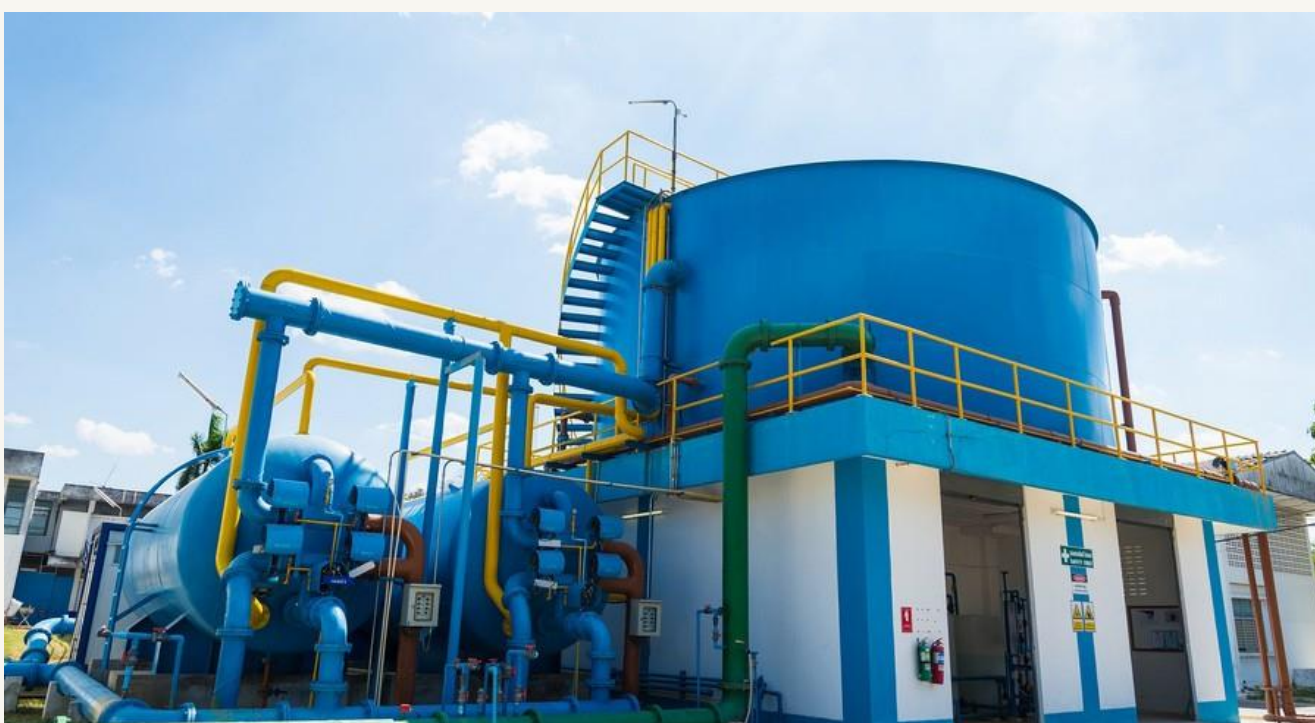
Industrial Wastewater Treatment Plant

With the implementation of integrated wastewater management strategies, an average reduction of up to 25% in water consumption, wastewater quantity and pollution loads of wastewater can be achieved. The potential payback period of the application ranges from 1-10 years (TOB, 2021).