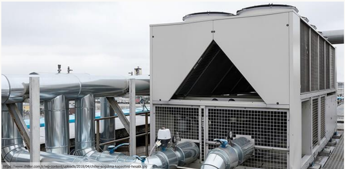
Cooling Systems (Chiller)

Closed-loop cooling systems significantly reduce water consumption compared to open-loop systems with more water-intensive use. In closed-loop systems, when the same water is recirculated in the system, cooling water is usually required to be added as much as the amount of evaporated water. Evaporation losses can also be reduced by optimizing cooling systems.