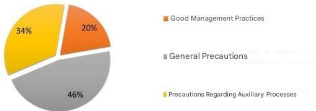
Percentage Distribution of Water Efficiency Practices